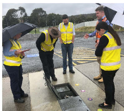
UPSS Training with Queanbeyan Palerang Regional Council