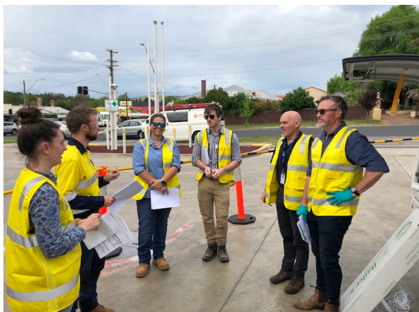
CRCB & EPA Meetings Training

Due to the ongoing COVID-19 restrictions many of the networking, working group discussions and training refreshers have been conducted via Zoom and Microsoft Teams. This has included the monthly meeting with the EPA, CRCB Group and the Regional Planners Group. Many of these meetings were facilitated and delivered either online or through scheduled onsite visits.