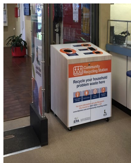
Example of small drop off station