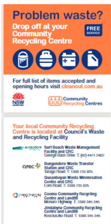
Bar coasters for distribution