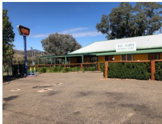
Young – UPSS replacement