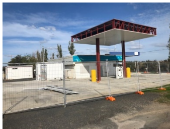
Harden – upgrade

There has also been consultancy meetings and onsite visits at Service Station Remediation works at Harden, Young and Wee Jasper. (below)