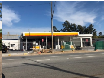
Wee Jasper – re commissioning