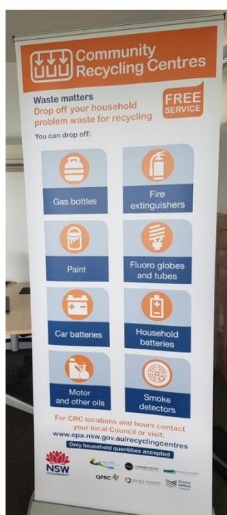
Banners to promote CRC