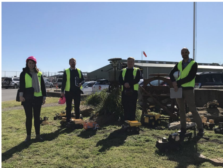
CRJO visit the Community Recycling Centre in Wingecarribee Shire Council.