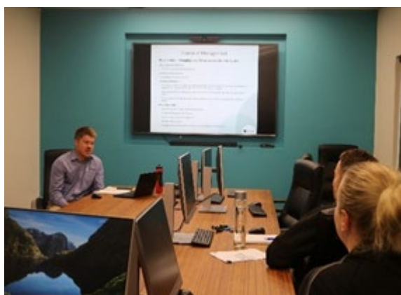
UPSS theory training with GMC

Training for Eurobodalla Shire Council and Bega Valley Shire Council is scheduled for the 28 th and 29 th of January 2021, whilst training for Wingecarribee will be scheduled for a date suitable to council, ideally in early 2021.