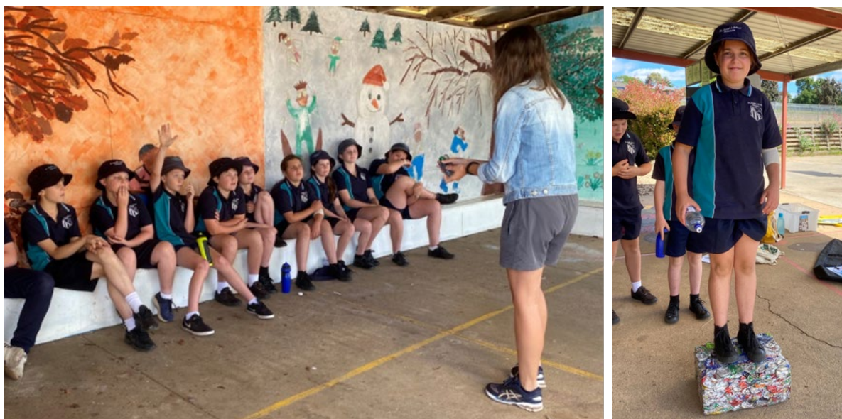
Environmentors at Bombala Catholic PS

CRJO is providing funding for a total of 80 waste education sessions throughout the region targeting pre-schools, primary schools and secondary schools. The sessions are delivered by Environmentors and Eaton Gorge Theatre Company. Below are few impressions from a primary school visit in Bombala and an online show that was produced by Eaton Gorge and was watched by over 20 preschools in Snowy Monaro Regional Council in November.