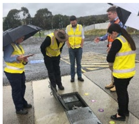
UPSS site inspection training with QPRC